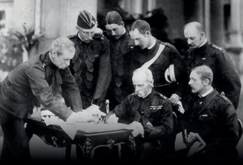
Lt Neville Chamberlain - pictured in Madras 1883 standing third from left, created the Sport of Snooker in Jubbulpore, India in 1875

The Billiards Association, Established in 1885 The Billiards Control Club, Established in 1908